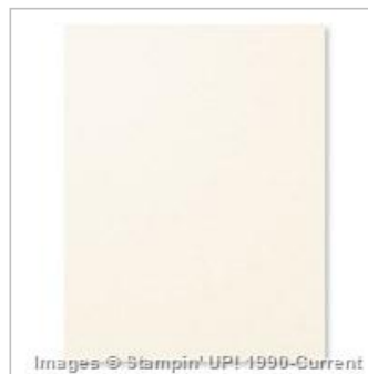
Very Vanilla 8-1/2" X 11" Cardstock