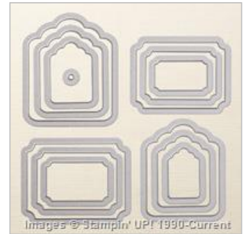
Tags & Labels Framelits Dies