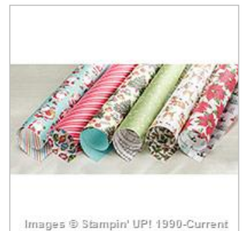
Home For Christmas Designer Series