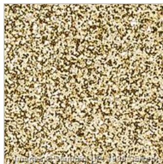
Gold Glimmer Paper