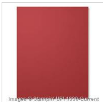
Cherry Cobbler 8-1/2" X 11" Cardstock